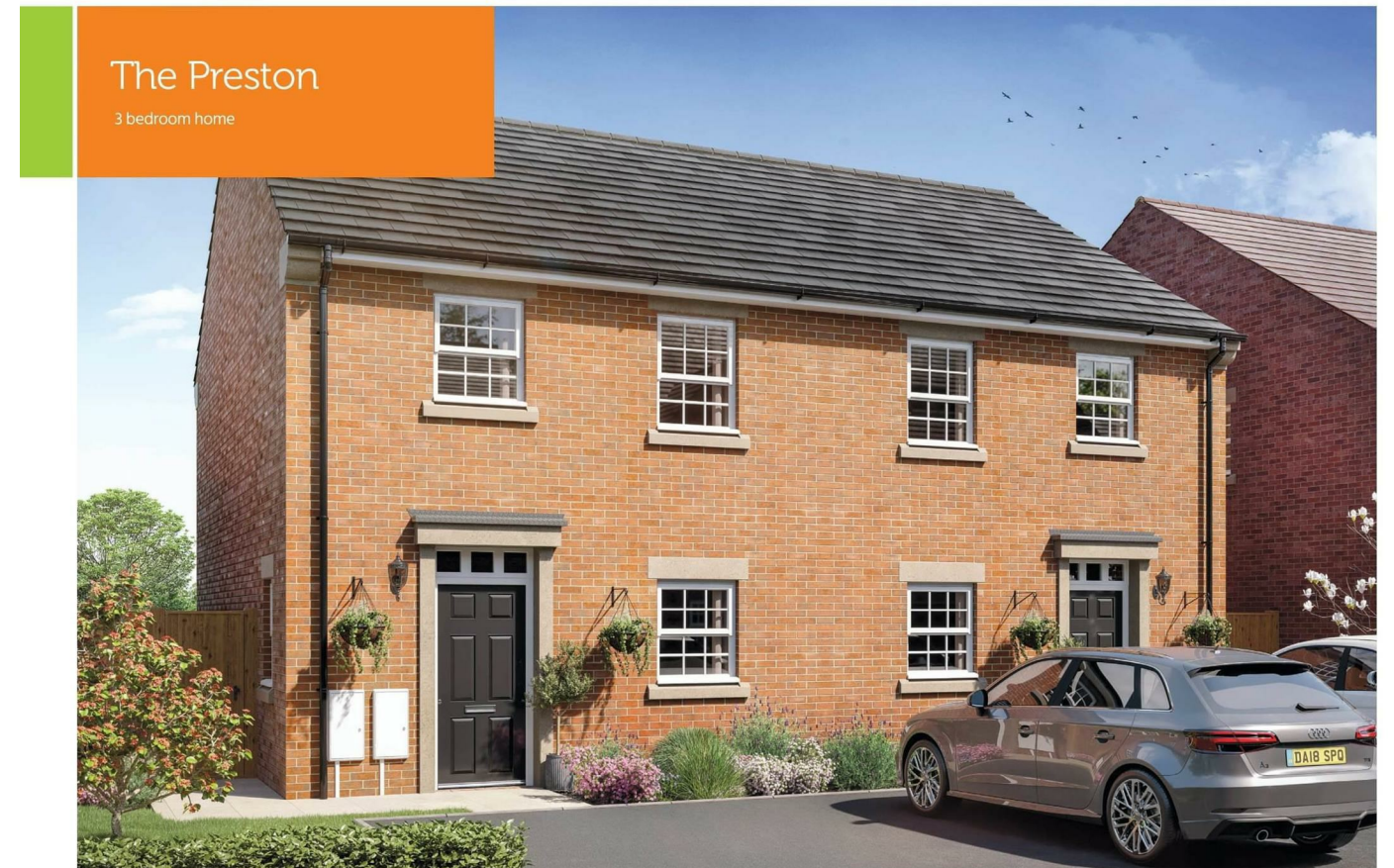
The Preston 3 bedroom home